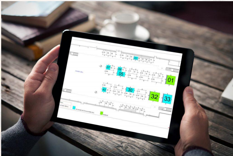
Exhibit Dates and Times

IECON program includes workshops, tutorials, panels, keynotes, and presentation of original research and industrial applications. The world's industry, research, and academia are cordially invited to participate in a wide array of technical and social activities for the advancement of science, technology, industry, engineering education, and fellowship.