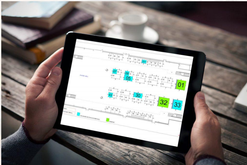
Exhibit Dates and Times

IECON program includes workshops, tutorials, panels, keynotes, and presentation of original research and industrial applications. The world's industry, research, and academia are cordially invited to participate in a wide array of technical and social activities for the advancement of science, technology, industry, engineering education, and fellowship.