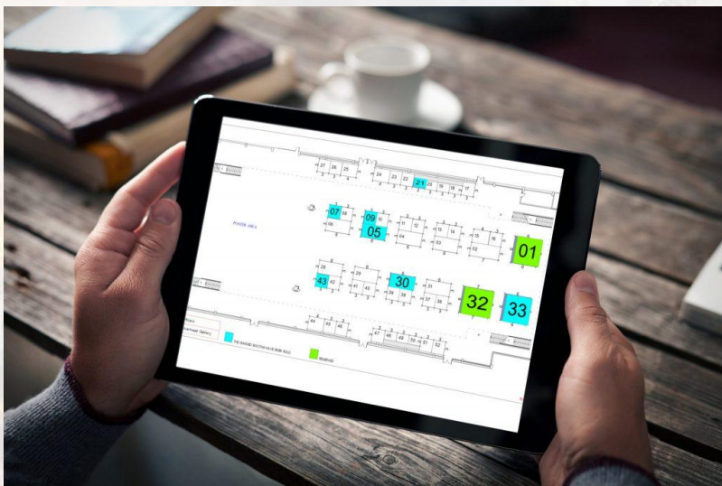
Exhibit Dates and Times

IECON program includes workshops, tutorials, panels, keynotes, and presentation of original research and industrial applications. The world's industry, research, and academia are cordially invited to participate in a wide array of technical and social activities for the advancement of science, technology, industry, engineering education, and fellowship.